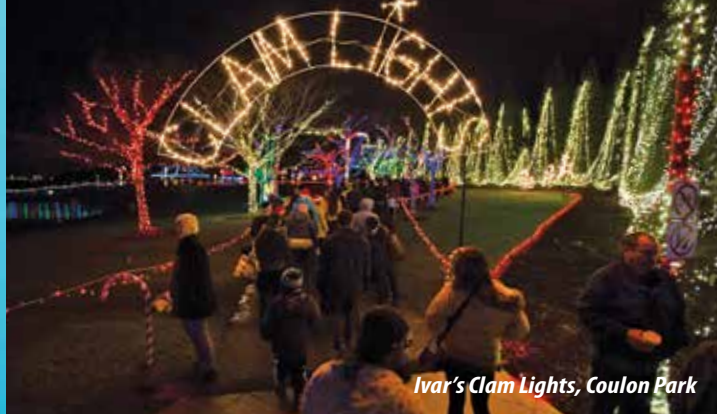
Ivar's Clam Lights, Coulon Park