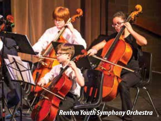
Renton Youth Symphony Orchestra