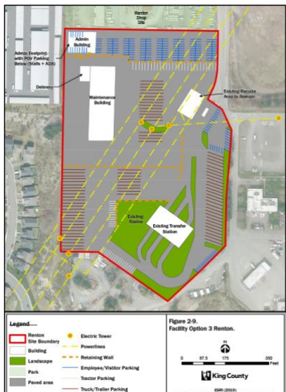
Click image for full-sized image.

Solid waste may be an issue that is quickly out of sight and out of mind for many of us after we empty the garbage or wheel our trash containers to the curb. But we're thinking about it a lot in Renton and expressing concerns over a possible King County Solid Waste Division decision to locate a support facilities center here in Renton. I hope you'll give this some thought too and be prepared to make your voice heard—especially if you live, work, or go to school in the Highlands Area.