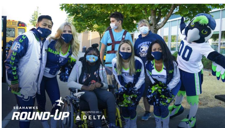
Seahawks Boom and dancers at Dimmitt Middle School on the first day of classes.

If you'd like to donate, email cisr@cisrenton.or or call 425-430-6658.