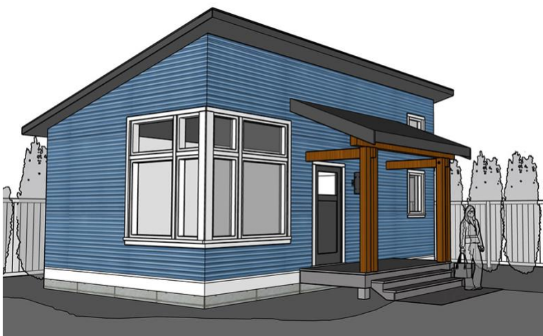
Baker: Permit-Ready Accessory Dwelling Unit

The center has been serving Renton's 50+ seniors for decades providing healthy and engaging opportunities to stay active, build relationships, and learn new skills.