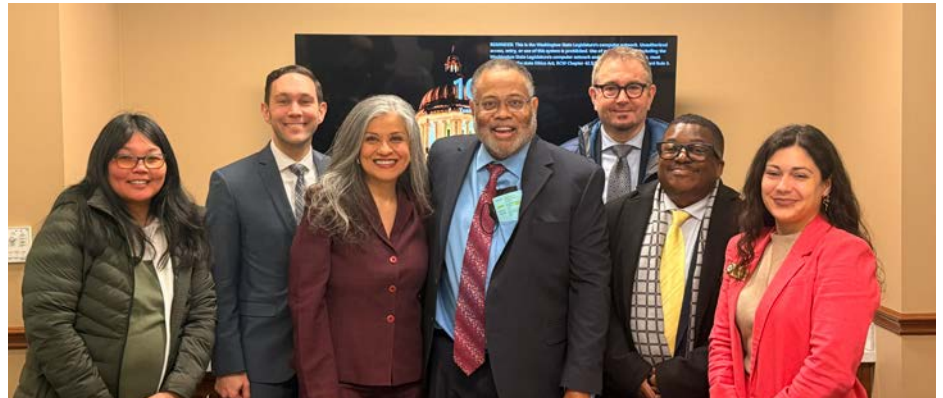
Mayor Pavone and City Councilmembers met with Washington State Representative, David Hackney.